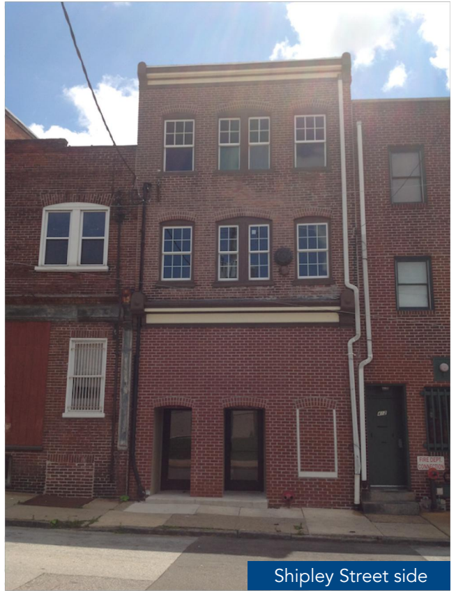
Shipley Street side