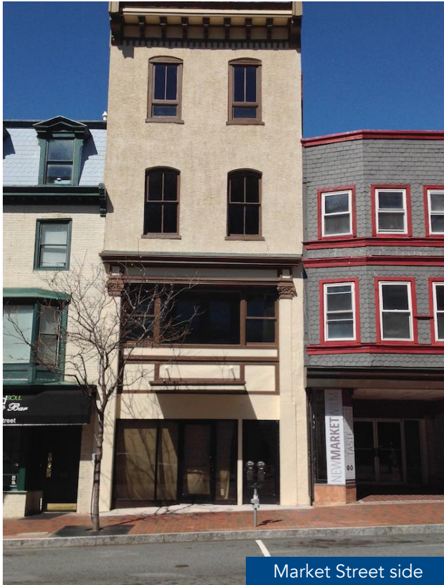
Market Street side